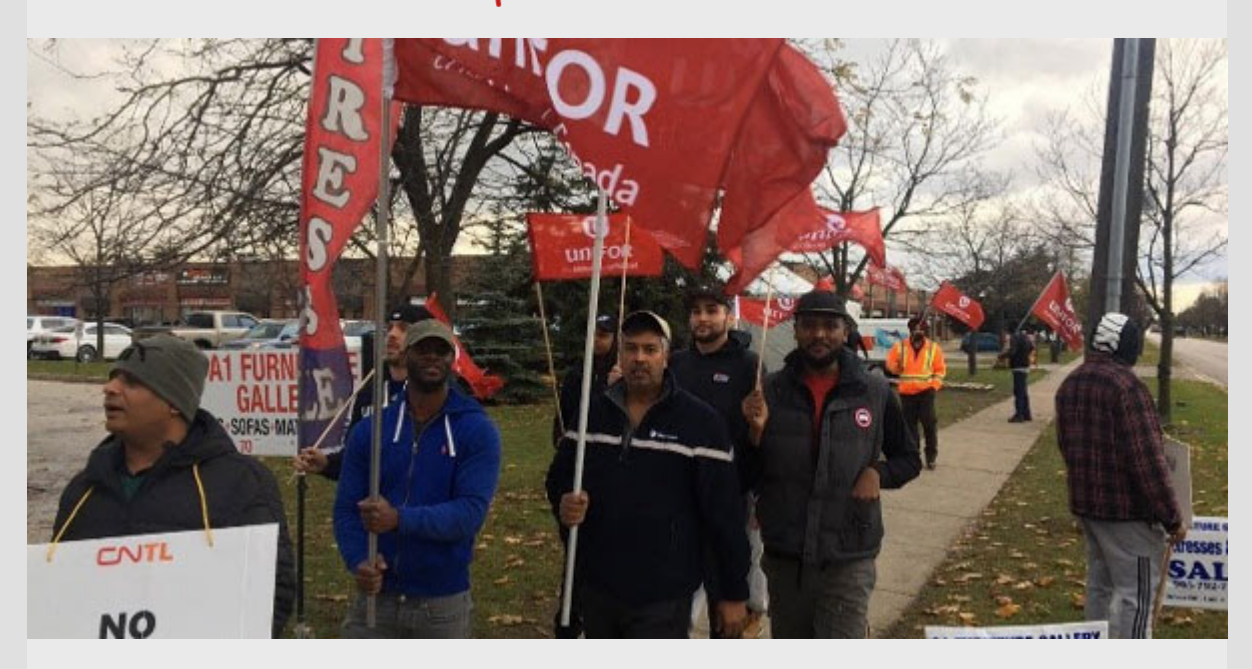
Local 4003 members at Canadian National Transportation Ltd. demand an end to deplorable, unsanitary working conditions.