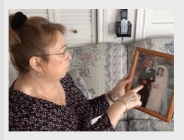
After multiple denials WSIB finally concedes that toxic chemicals played a role in death of GE worker.