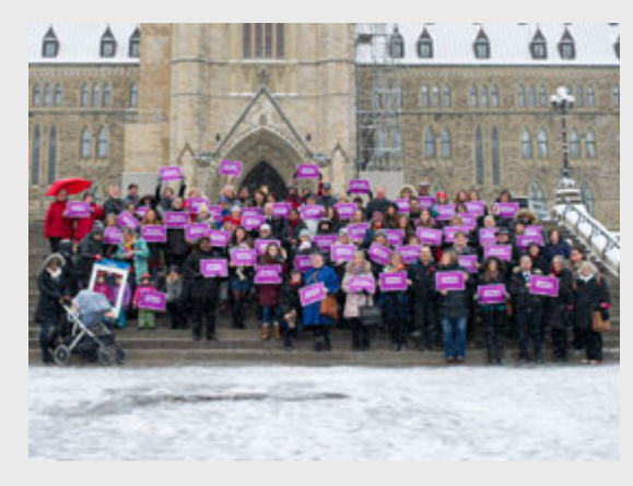
Members advocate for universal, affordable, inclusive and high quality child care, together with Child Care Now.